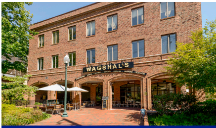
WAGSHAL'S GOURMET MARKET